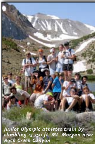
Junior Olympic athletes train by climbing 13,750 ft. Mt. Morgan near Rock Creek Canyon

Far West Nordic completed another incredible summer of Junior Training Camps, where young athletes from 12 years old to 20 learned xc ski skills and developed training disciplines. From the high-level Regional Elite Group camp in June, to our Easter Sierra June Lake camp in July, the Tuolumne Meadows Yosemite Camp and our Bliss State Park Lake Tahoe camp for younger athletes in August, this has been a great summer for our young athletes.