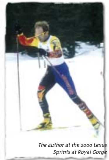
The author at the 2000 Lexus Sprints at Royal Gorge

SkiPost is a cross-country skiing informational, educational and motivational service, brought to you through a partnership with the Subaru Factory Team, www.dreamofit.com , the Fischer-Salomon Athlete Force and the Fischer-Salomon-Swix-Subaru Event Force. To subscribe, visit www.skipost.com or email weanswer@skipost.com .